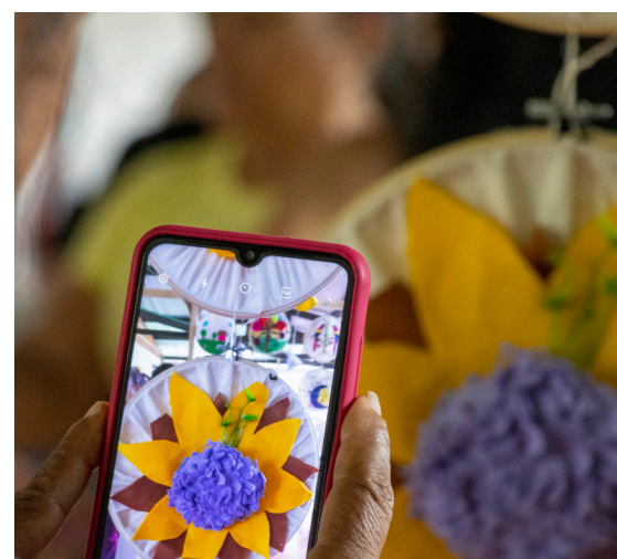
Casa Común