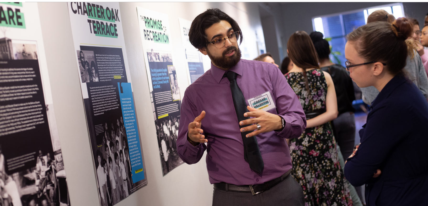
Past exhibit “From Civil Rights to Human Rights: African American and West Indian Housing Struggles in Hartford County 1940-2019,”