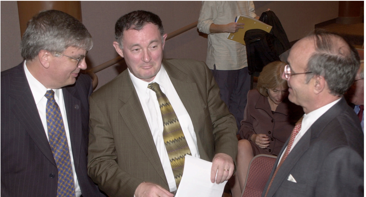
Film still, "A Legacy Without Limits"